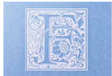
Paper finishing with laser engraving

Send us your materials and samples: Our application technicians will help you find the best laser system for you.