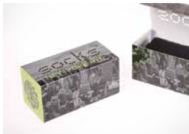
Smart packaging with laser perforation and cutting