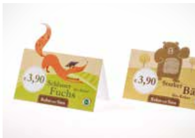
Exceptional POP stand-up displays

→ Trotec Lasers – designed and built in Austria.